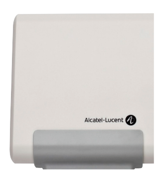
8340 Smart IP-DECT AP Integrated Antennas 3BN67188AA 8340-C Smart IP-DECT AP integrated antennas 3BN67190AA

The Alcatel-Lucent 8340 IP-DECT is HD-voice ready according to CAT-iq and will protect your investment when end to end high audio quality will be available and is compatible with existing 4080 IP-DECT installations.